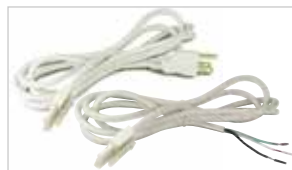
NUD Series Hardwire Connector

Note: LEDUR NUD-88 Series can be direct wired into fixture.