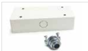
NUD Series Junction Box