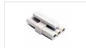
End to End Connector

Used to join fixtures together or to NUA-802.