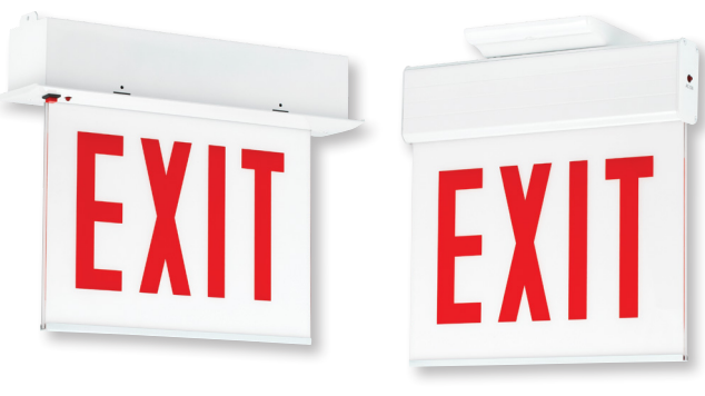
Recessed Ceiling Mount