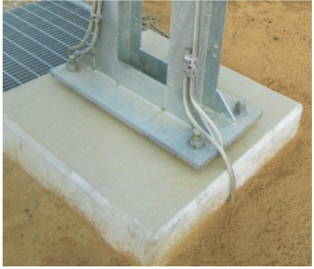
Cu-Bond Composite Cable Ground Riser