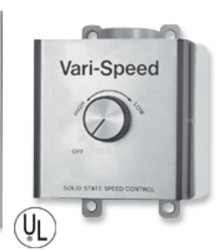
Model 100F Model 105F Model 277V-5 Model 277V-6