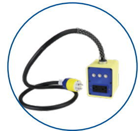
CDU20 & 30 Amp