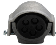
3/4" to 2" size