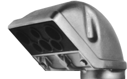
2 1/2" to 4" size