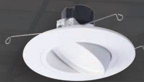
LED Adjustable Downlight