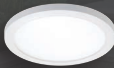
Surface LED Luminaire