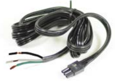
72" Cord & Plug

NUA-804B Black NUA-804W White Used to hardwire NUD-88 fixtures to NUA-802 or junction box (by others). Finish: Black or White