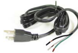
72" 3-Wire Grounded Hardwire Connector

NUA-803 Used to join two NUD-88 fixtures seamlessly together. 3-wire grounded connector. Finish: White