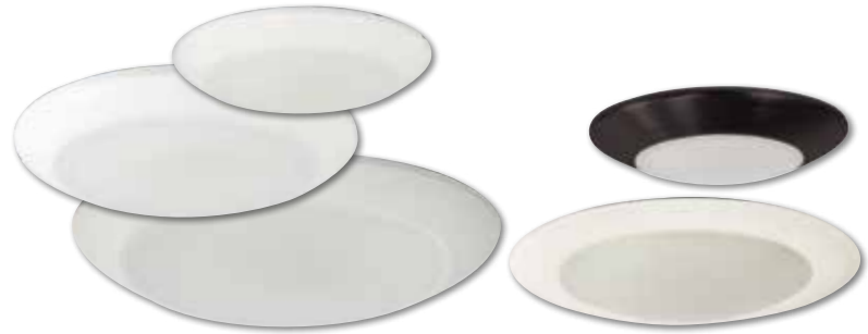
NLOPAC-R4T24 24 / NLOPAC-R6T24 24 / NLOPAC-R8T24 24