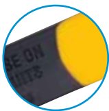
Smart-Grip™ Dual Durometer Molded Grip